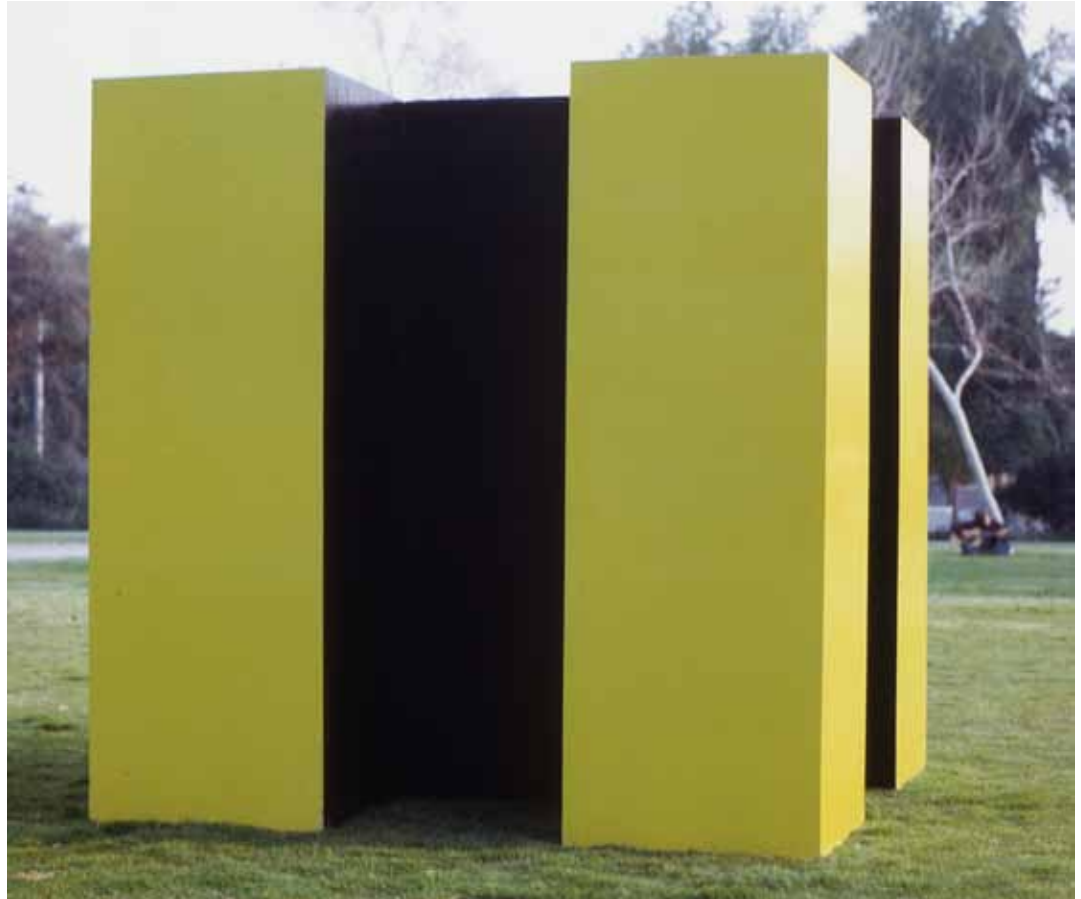
Chris Burden, Untitled sculpture , 1967 Lacquer paint on plywood 6 × 6 × 6 ft. (1.8 × 1.8 × 1.8 m)