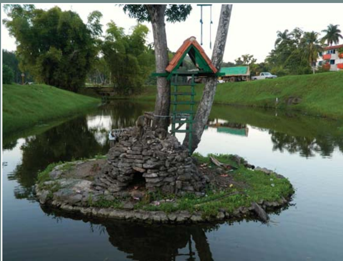
A mini-lake in the "Las Terrazas" bio-reserve beautifully reflects the Cuban landscape.

I'm involved in a "baile folklórico" class held at the National Theater for three CUC (basically three dollars) a month. The class meets three times a week with Cubans who, to me, dance professionally—although they might state otherwise.