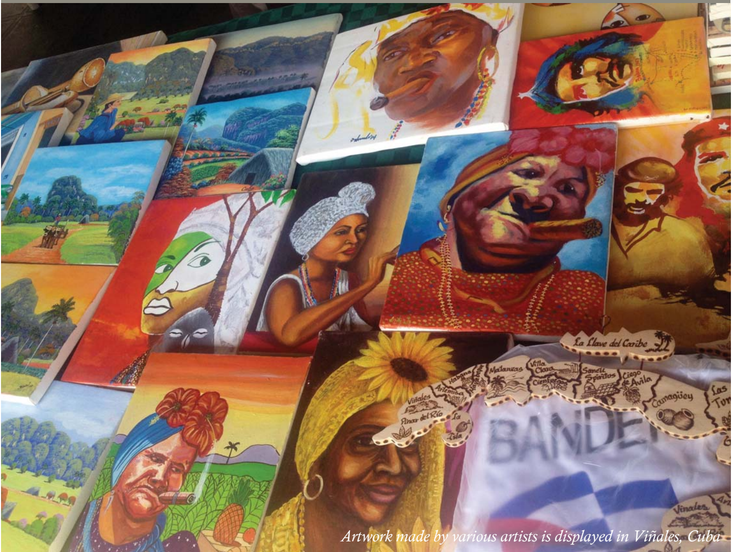
Artwork made by various artists is displayed in Viñales, Cuba

A PUBLICATION OF THE POMONA COLLEGE OFFICE OF STUDY ABROAD { FALL 2014 }