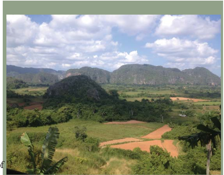
The region of Viñales, where we went to ride horses for a weekend excursion

I was able to watch the International Ballet in Cuba for less than an American dollar a ticket, experience horseback riding with my host program in Viñales over the weekend and continue to enjoy the peacefulness this island brings.