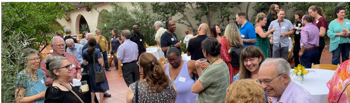
Department Celebration, August 2023