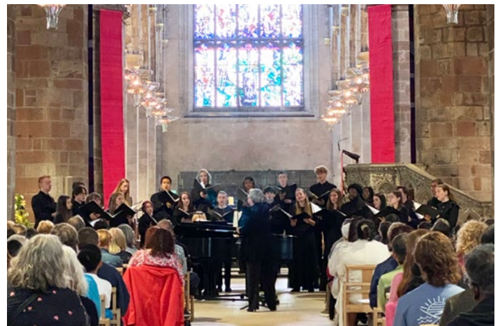
St. Giles, Edinburgh, Scotland