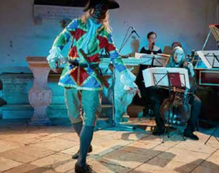
LONDON HANDEL PLAYERS