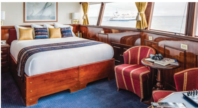
Category 5 cabin.

SHARED ACCOMMODATIONS: Shares can be arranged at the double occupancy rate in Categories 1 and 2 only.