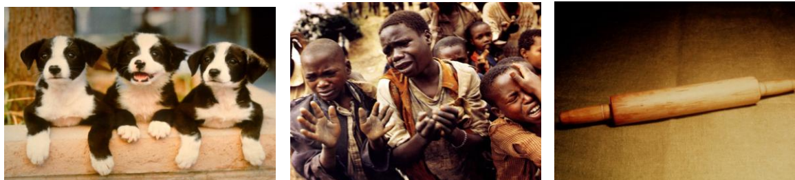
Figure 1. Sample experimental stimuli from the International Affective Picture System (IAPS). From right to left: Happy, Sad, Neutral

1 Taken from IAPS standardized ratings. Both Valence and Arousal are measured on a scale from 1(least pleasant/least arousing) – 9 (most pleasant/most arousing)